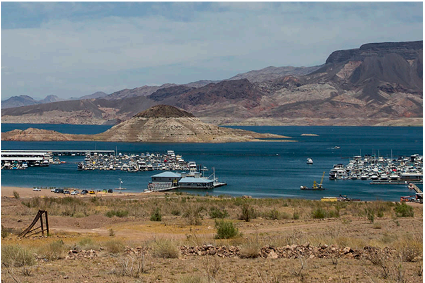
Lake Mead Marina on Thursday, June 1, 2017.

Several hundred billion gallons of water has vanished from federal forecasts for Lake Mead over the past two months, but Bureau of Reclamation officials insist there's no reason to panic.